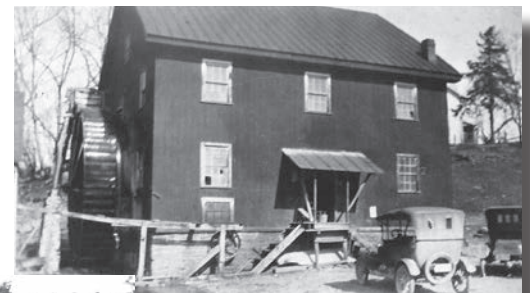
An early 1900s picture of the McNeel Mill.